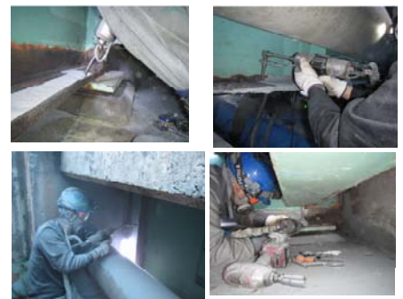
Photo 2 CS treatment under narrow space condition

http://www.structur.tec.u-ryukyu.ac.jp/ (Ryukyu Univ. Faculty of Eng. Structural Eng. Lab.)