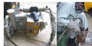
Photo 1 CS equipment

To apply the narrow space at the target bridge and to improve the treatment efficiency, CS nozzles were invented. Moreover, semi-automatic treatment equipment was developed. Using the