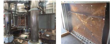
Photo 3 Full scale specimen test