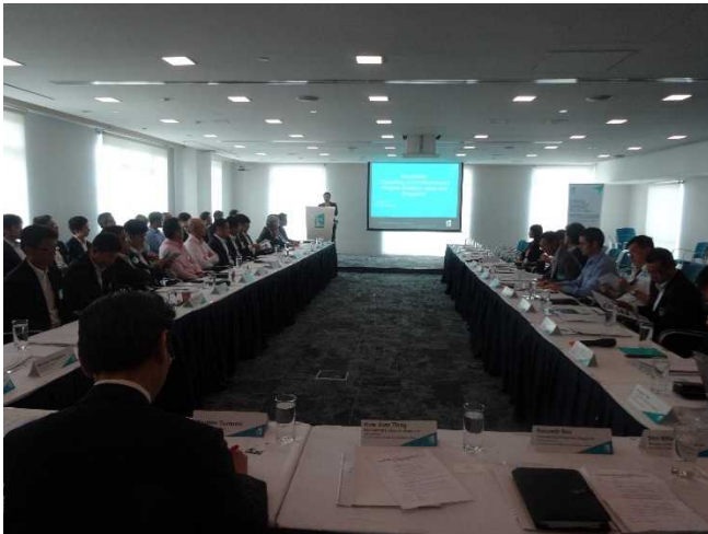
▲ Venue (IE Singapore in Singapore) [1 st Japan-Singapore Joint Roundtable]