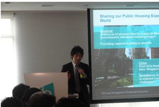
▲ Presentation by MLIT (Gv't of Japan) [1 st Japan-Singapore Joint Roundtable]