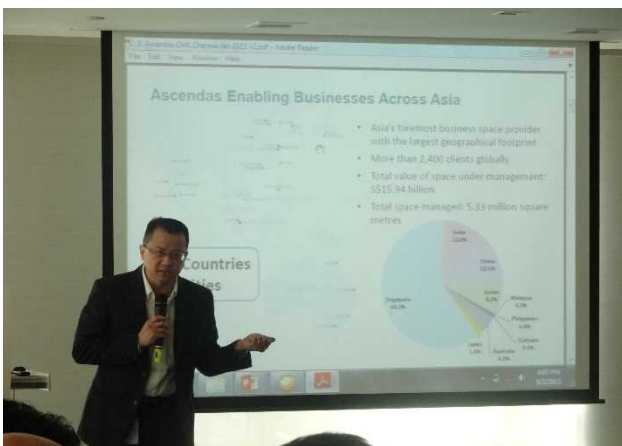
▲ Presentation by Ascendas (Singaporean company) [1 st Japan-Singapore Joint Roundtable]