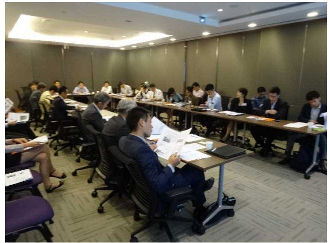
▲ Venue (PwC Building in Singapore) [2 nd Japan-Singapore Joint Roundtable]