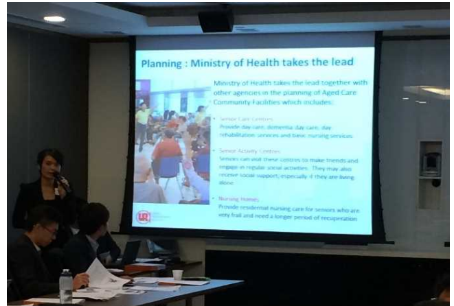
▲ Presentation by URA (Gv't of Singapore) [2 nd Japan-Singapore Joint Roundtable]