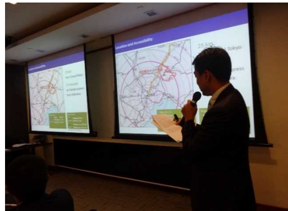
▲ Presentation by Mitsui Fudosan (Japanese company) [2 nd Japan-Singapore Joint Roundtable]