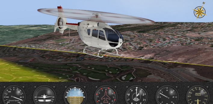
Playback cockpit image