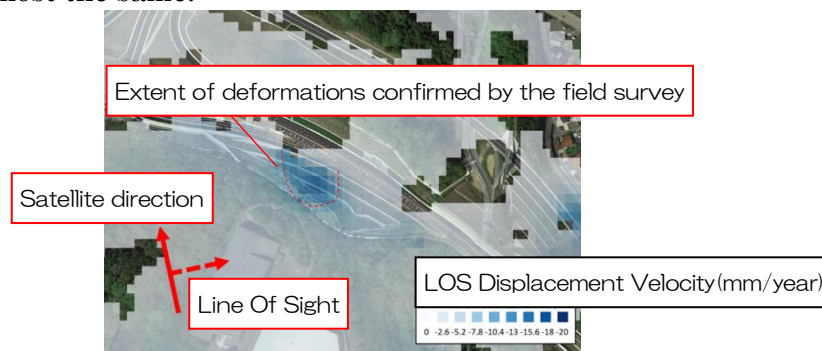
Fig. 1 Comparison between field survey and Interferometric SAR of slope failure area

A comparison of the results of the Interferometric SAR analysis and field survey in the Kisa area of Onomichi-Matsue Expressway is shown in Figure-1. It can be seen that the extent of the deformation is almost the same.